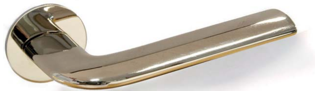
▲ First prototype in nickel

A range of door handles and associated fittings commissioned by ironmonger Izé with the first prototype being produced at the end of 2011.