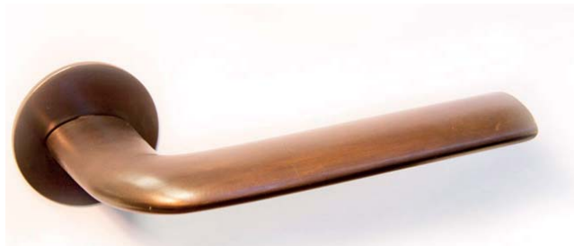
▲ First Prototype in brass